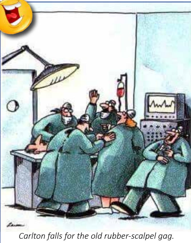
Carlton falls for the old rubber-scalpel gag.