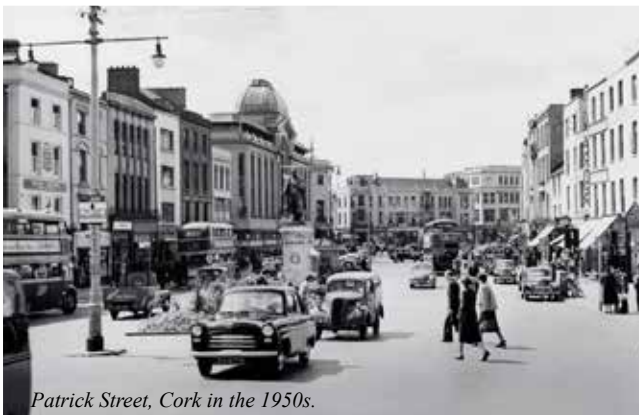
Patrick Street, Cork in the 1950s.

We loved going to look at the Christmas toys in the shops. One shop had a train set working, right there in the window. We gazed in amazement, with our noses pressed against the glass, as the engine chuffed along the tracks which wound in and out amongst the bright new toys. Another shop had the latest bikes and scooters on display and every child secretly dreamed of owning one.