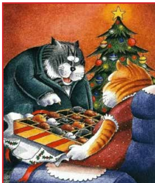
"These little ones are mice... These over here are hamsters... Ooh! This must be a gerbil!"

All of that said, as far as we know, there's no one out there who's actually a professional cat herder. If there were, this day would actually be for those folks. This is a day for everyone who has to face the frustration of trying to manage the unmanageable, anyone whose day to day life involves insurmountable tasks.