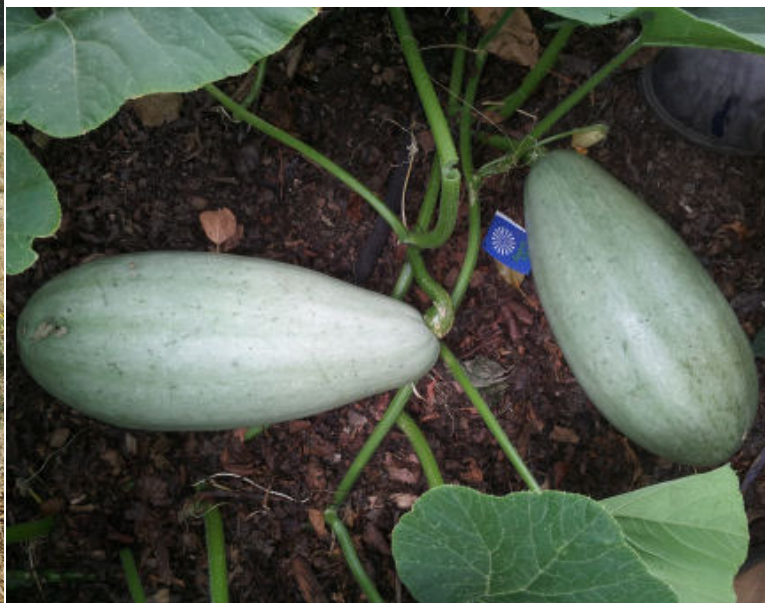
Greek Samson Squash