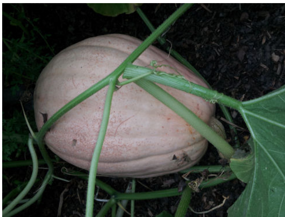
Red American Pumpkin