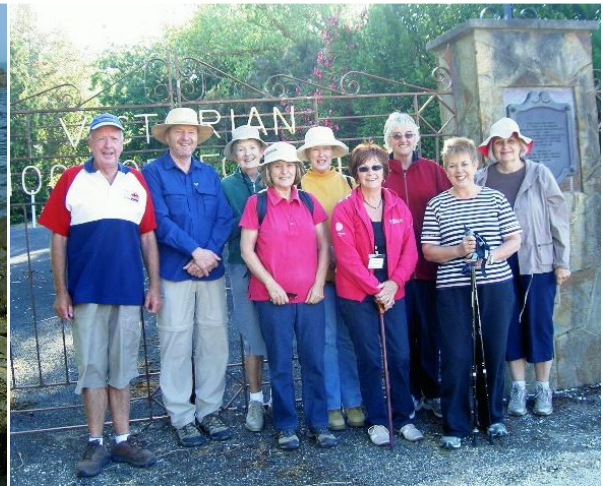
Bushwalking group having a "Seachange."